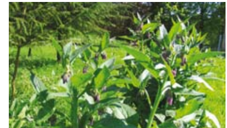
Cover picture: Comfrey at Whithaugh