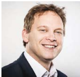
Housing Minister Grant Shapps

New programme will give social tenants voice to challenge local decisions