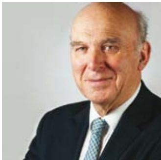
Business Secretary Vince Cable

Business Secretary Vince Cable announces first steps in a government funded bank to help small and medium sized businesses.