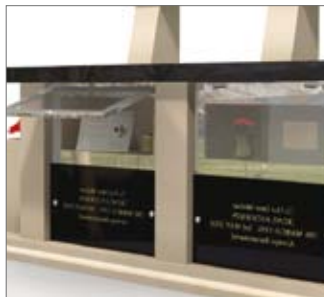
Niche and Keepsake arrangement