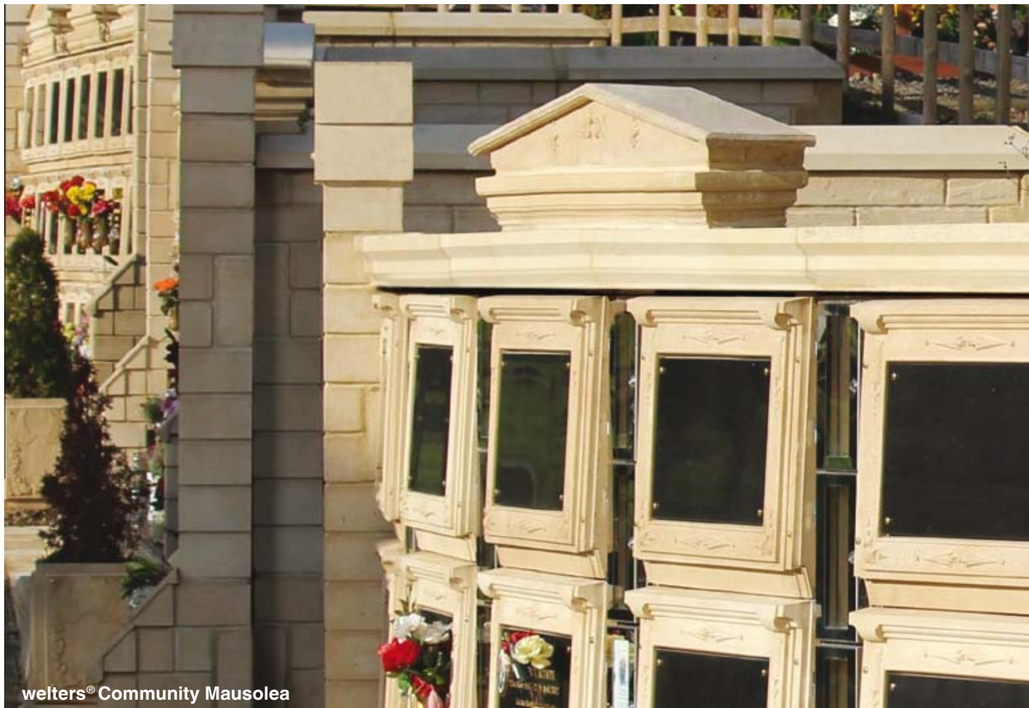
welters® Community Mausolea