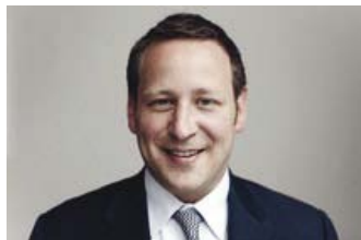
Communications Minister Ed Vaizey

Comms Minister says agreement is “great news for consumers”